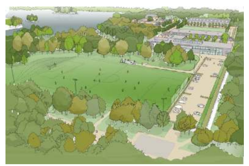
Artist's impression of the site

46. It is proposed that a range of artificial & natural pitches will be provided of varying sizes to meet the needs of both the Academy and First Team squads. These will be sites on the former 9 hole golf course and will be built to a very high standard. The layout of these pitches has been subject to significant negotiation in order to maintain the most appropriate amount of vegetation in line with the historic vegetative layout of the park. This retention has been informed by historic maps of the park. The layout and form of the pitches are considered acceptable in planning terms subject to final agreement of the landscaping and contouring of the land by planning condition. The pitches will attract a certain amount of paraphernalia such as goals, netting, flood lights etc., the level of paraphernalia shown in the illustrative plans and DAS is considered reasonable and these are easily removed from the site, as such any harm caused by ancillary paraphernalia is largely reversible.